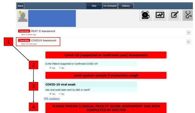
Fig 1. Individual COVID-19 assessment interface. This is accessed from the individual patient tile; once submitted the patient is automatically transferred into the live dashboard COVID-19 report.

Authors: A intensive care and respiratory consultant, Worthing Hospital, Worthing, UK and visiting senior lecturer, University of Surrey, Guildford, UK; B anaesthetic registrar, Worthing Hospital, Worthing, UK; C anaesthetic CT3, St Richard's Hospital, Chichester, UK; D informatics fellow, Worthing Hospital, Worthing, UK; E intensive care consultant, Worthing Hospital, Worthing, UK; F intensive care consultant, Royal Surrey County Hospital Guildford, UK and professor, University of Surrey, Guildford, UK