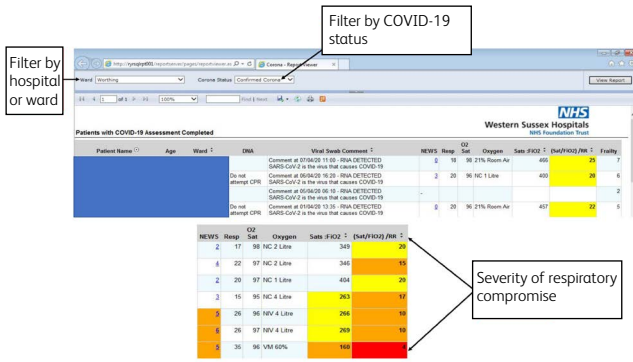
Fig 2. COVID-19 report interface. This live dashboard highlights location of patient, test status (suspected, awaiting test, confirmed), latest physiological variables and clinical frailty scale assessment.