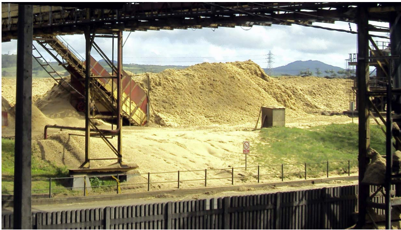
Fig. 1. Bagasse storage facility in Mauritius.

bagasse electricity [3]. The potential for cogeneration from bagasse has been estimated at 135,029 GWh per year globally [4] and 3885 GWh per year in Eastern and Southern Africa [5]. An analysis of five selected countries in Eastern and Southern Africa showed that there was potential to double the contribution of electricity produced from bagasse cogeneration [1].