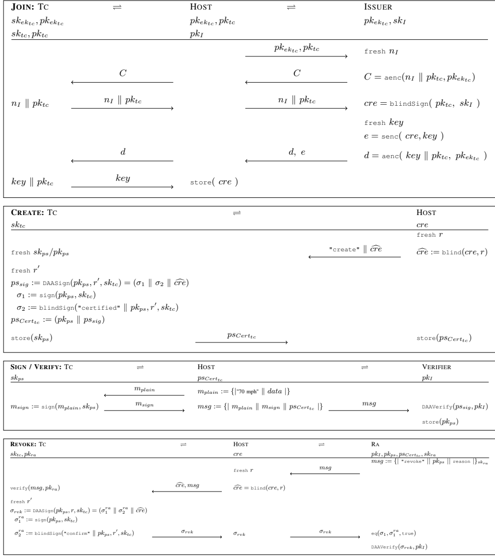
Fig. 2: High-level overview of the V2X DAA protocol interfaces.

issuer publishes its public key pk_I and the security parameters K_I . A vehicle's TC generates a DAA key pair: sk_{tc} / pk_{tc} using K_I , and publishes its public key pk_{tc} . The TC then releases the public keys pk_{ek_{tc}} and pk_{tc} to the vehicle.